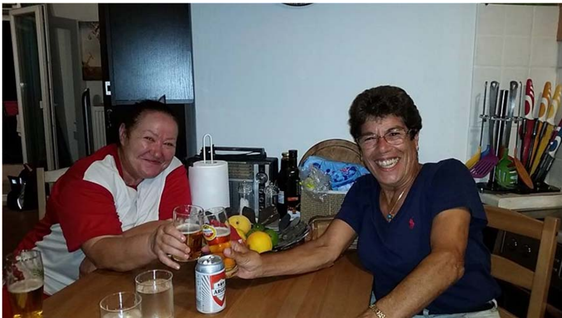
Picture 18. The last time these two ladies met was in Okinawa, this time was in Greece...What about next time...?