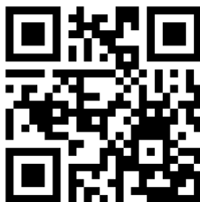
Graph 1. QR code and link to the event's video on Youtube: https://youtu.be/Uo1hOWGhB7M

The event was completed with a small party, with drinks, homemade delicacies and sweets. We wish to thank all of our friends for joining us.