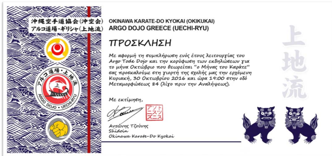
Picture 29. The invitation to Argo Dojo first year anniversary celebration.

Argo Dojo is already one-year-old!!! Time has passed fast!!! It is like yesterday when we passed the door for the first training. During this first year we had more than 150 training days, we made new friends we experienced things far beyond our imagination! This is what motivates to continue and do more things in the future. The celebration was organized on the first weekend after the 25 th of October, which is the Day of Karate in Okinawa and our Dojo's birthday. More than 25 friends, relatives, fellow martial artists and members of other Dojo honored us with their presence. The event started with a short presentation on the history of Karate and the style of Uechi-Ryu. Right afterwards, Argo Dojo students offered a demonstration which included: