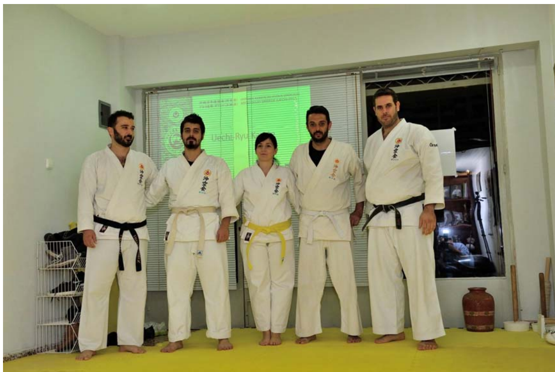
Picture 35. After the end of the demonstration we are all happy and proud, looking forward for the next big event of Argo Dojo!