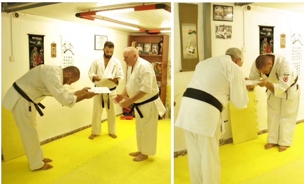
Picture 13a & 13b. Certificates of appreciation for all of our guests!